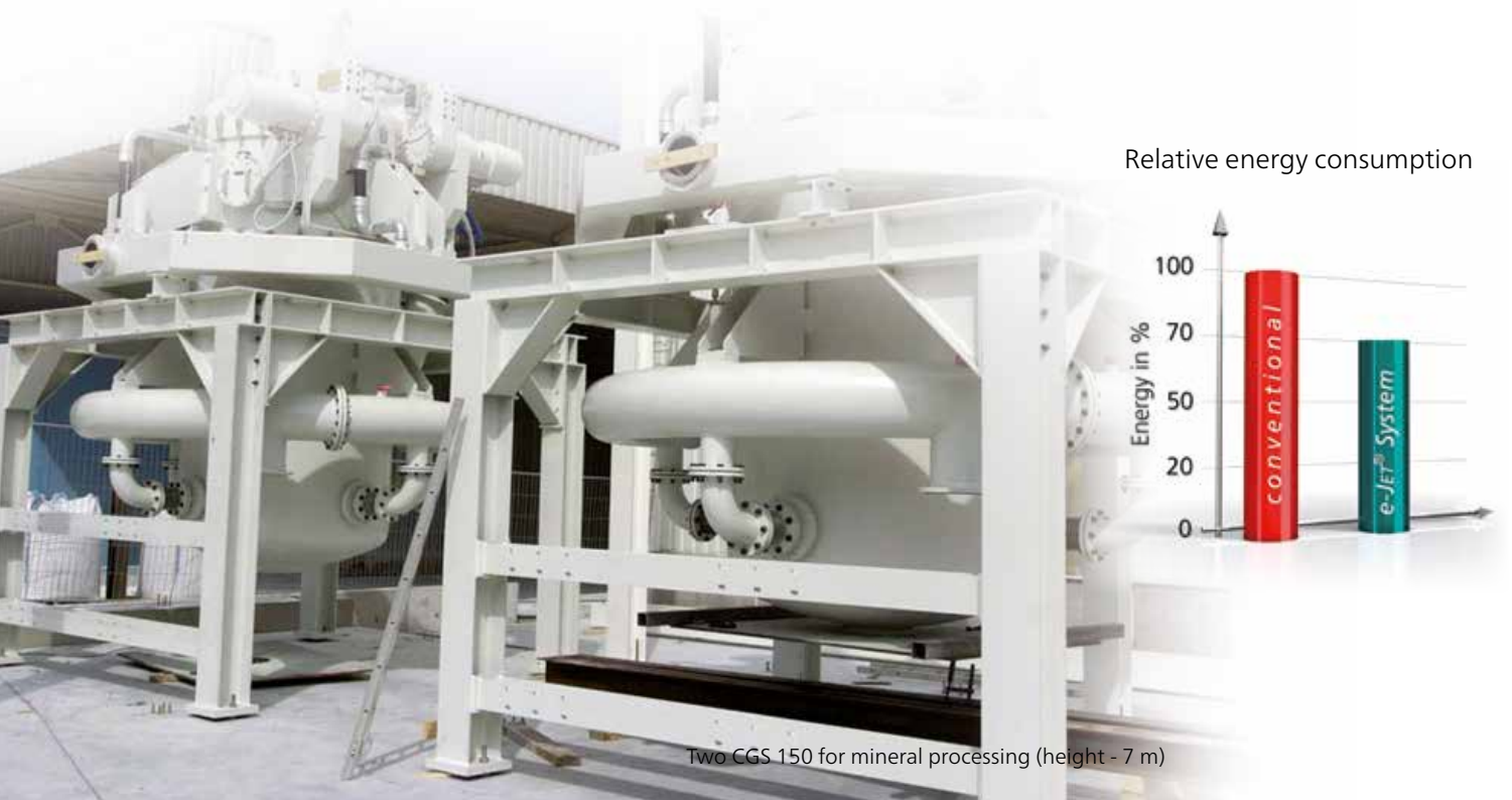
Two CGS 150 for mineral processing (height - 7 m)

NETZSCH-Trockenmahltechnik GmbH has also developed the S-JET ® process for dry fine grinding into the submicron range. The S stands for superheated steam and superfine. The superheated steam creates a jet stream that can reach speeds of up to 1 200 m/s and more - as compared to the 570 m/s of conventional jet mills - resulting in the finest particle sizes in dry processing. Sizes below 1 \mu\text{m} are possible with S-JET ® processing mills. Another benefit is a dramatic increase of the capacity compared to standard grinding conditions. With E-JET ® and S-JET ® the CGS mills are prepared for existing and future market requirements when it comes to quality, efficiency and economy. All of our machines are designed for easy cleaning and maintenance. Large doors, simple classifier wheel changes and easy to clean inside surfaces keep the cleaning time as short as possible.